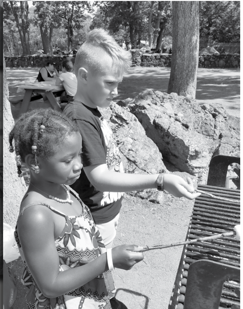
Photos: CDT members playing at Party in the Park, Aug. 2017.