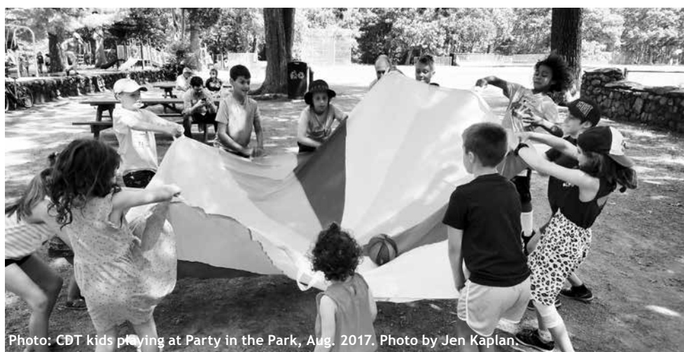
Photo: CDT kids playing at Party in the Park, Aug. 2017.