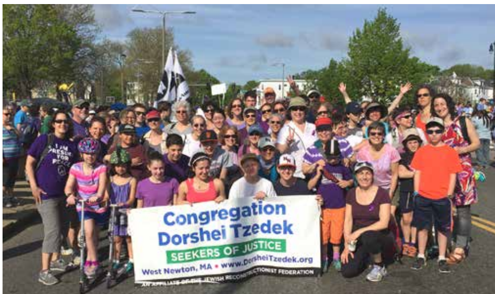
CDT members at the 2015 Mother's Day Walk for Peace. Join this year's 21st Annual Mother's Day Walk for Peace - details on page 7.