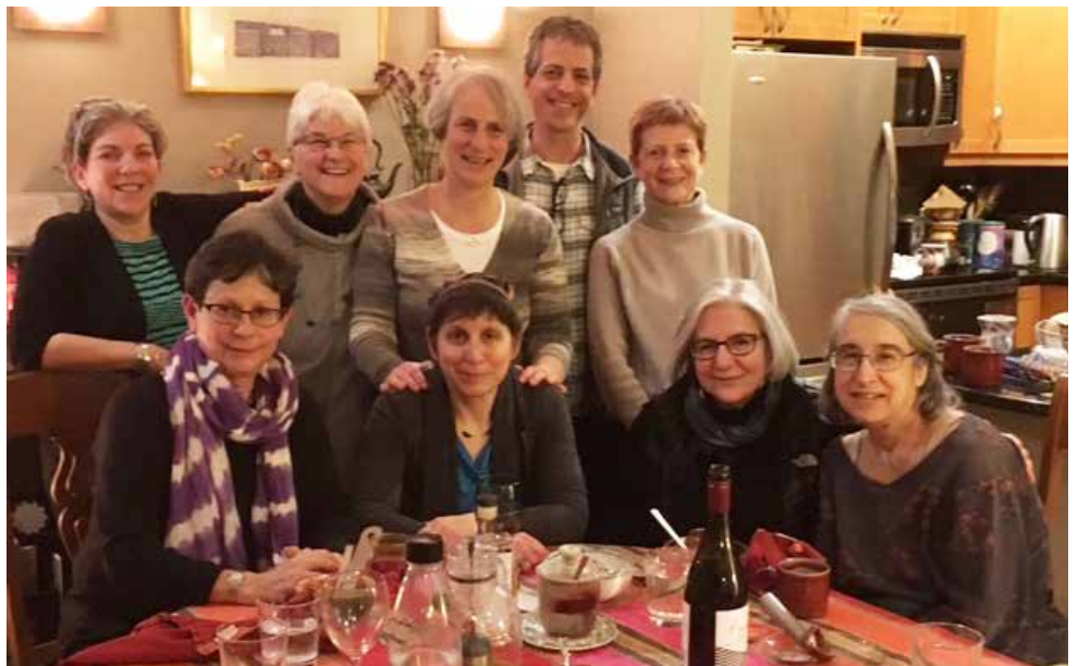
Happy congregants at the Goodman-Weil potluck in March