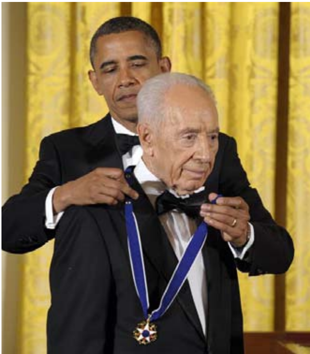
President Barack Obama awards Shimon Peres the Presidential Medal of Freedom at the White House on June 13, 2012.