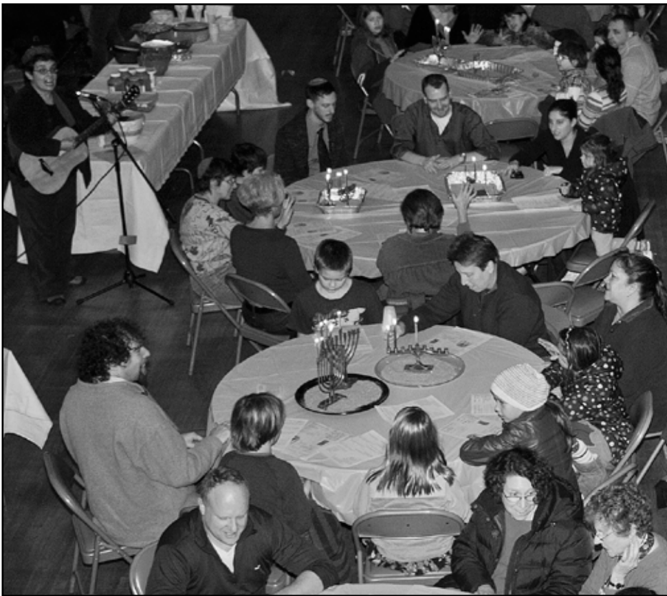
Many hands are needed to create a successful CDT event, such as the annual Hanukkah Party.