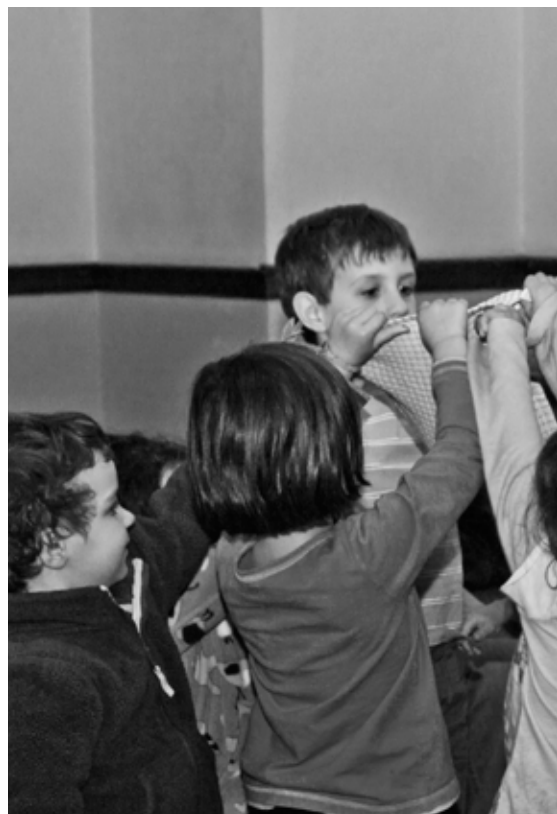
CDT kids at the Sukkah Party, October 2014