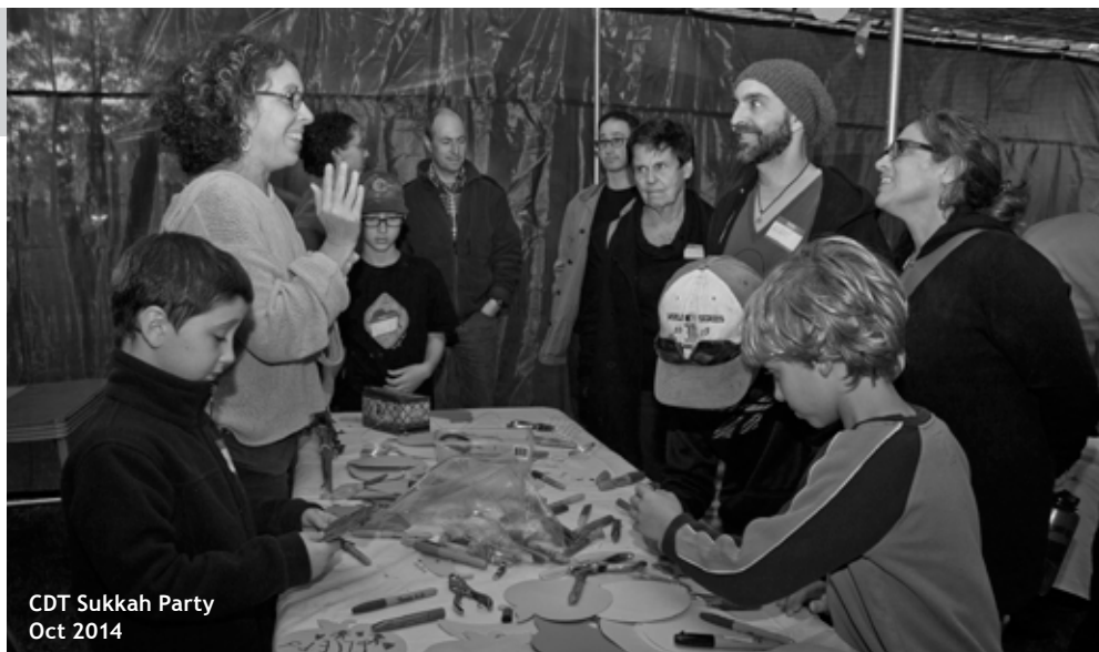
CDT Sukkah Party Oct 2014

Parents of students in 5th, 6th, 7th & 8th grades , who generally help out with B'nei Mitzvah kiddush, ushering and sanctuary clean-up, can primarily find their names listed on B'nei Mitzvah dates.