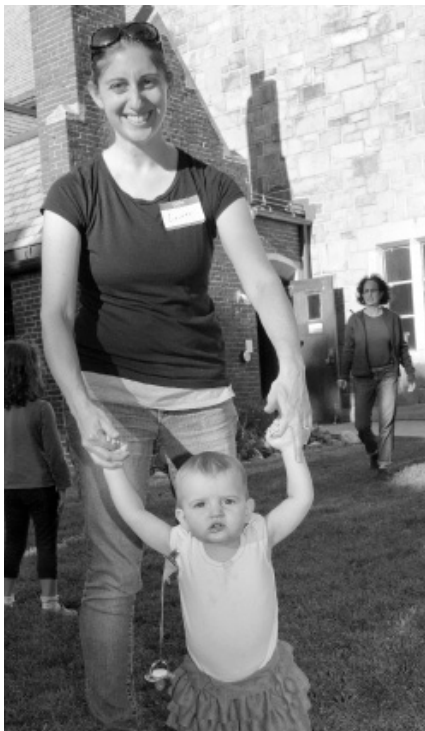
L'dor v'dor from generation to generation

Today, it takes a considerable amount of intention and effort to remain connected to Jewish practice and have a sense of Jewish community. Communities like Dorshei Tzedek are, to my mind, profoundly countercultural, primarily because Judaism itself is countercultural. Where America emphasizes the individual, Judaism emphasizes the communal. Where our capitalist culture celebrates constant material accumulation, Jewish tradition puts spiritual practice and concern for others as our central responsibility. In an increasingly universalistic, culturally intertwined world, Judaism is at its root a tribal culture, affirming the particularity of Jewish tradition.