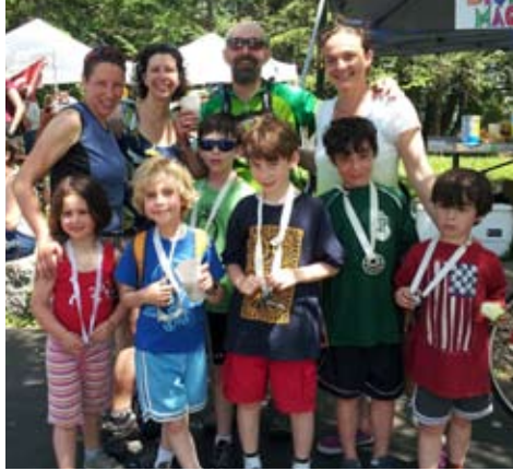
CDT joined Bikes Not Bombs for their annual Bike-A-Thon in June 2013.