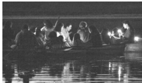
Havdalah on the Water, 2011 Shabbat Unplugged.

UNLESS NOTED OTHERWISE, ALL SHABBAT PROGRAMS ARE HELD AT THE DORSHEI TZEDEK PRAYER SPACE: 60 HIGHLAND STREET IN THE SECOND CHURCH OF NEWTON, WEST NEWTON. SHABBAT MORNING SERVICES ARE HELD WEEKLY, STARTING AT 9:45 AM. FREE CHILDCARE IS AVAILABLE DURING SHABBAT MORNING SERVICES IN ROOM 112. FOR THE COMFORT AND HEALTH OF OUR MEMBERS AND GUESTS, WE ASK EVERYONE ATTENDING OUR SERVICES TO AVOID WEARING FRAGRANCES (PERFUME, COLOGNE, HAIR AND BODY SPRAYS).