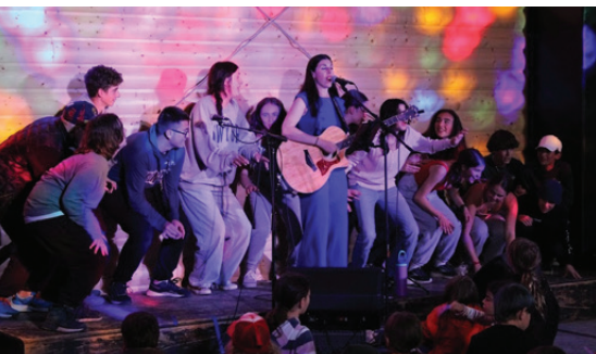
Shwayder Camp 2023