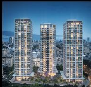
N Sokolov Netanya