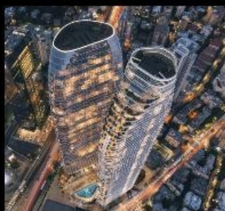
Exchange Ramat Gan