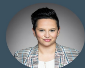
MELISSA LANTSMAN Member of Parliament Deputy Leader of His Majesty's Loyal Opposition