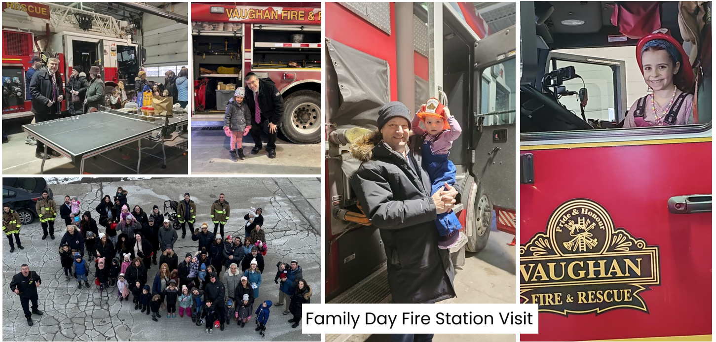
Family Day Fire Station Visit