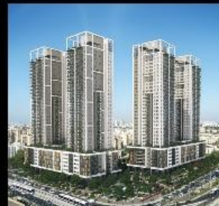
Moment Bat Yam