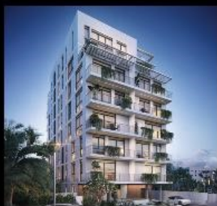
Remez Tel Aviv