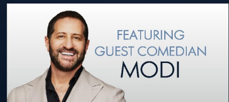
FEATURING GUEST COMEDIAN MODI

Voted one of the top 10 comedians in New York City by The Hollywood Reporter, Modi is one of the comedy circuit's most sought after performers!