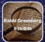
Rabbi Greenberg 9:15-9:45

Sponsorship opportunities available, contact Rav AZ Thau at az@mizrachi.ca