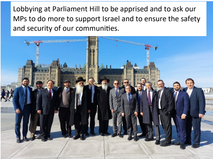
Lobbying at Parliament Hill to be apprised and to ask our MPs to do more to support Israel and to ensure the safety and security of our communities.