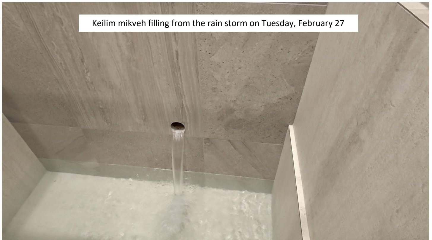
Keilim mikveh filling from the rain storm on Tuesday, February 27

For more information www.bayt.ca/meetingofthemembership#