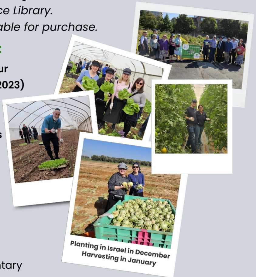
Planting in Israel in December Harvesting in January

We thank the Federal Government's New Horizons for Seniors program for its ongoing financial support. We thank the following organizations for their ongoing in-kind support: