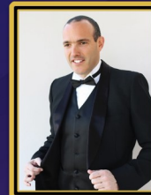
Cantor Shai Abramson Israel