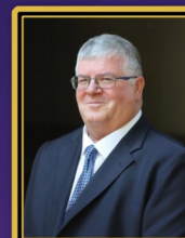
Maestro Raymond Goldstein Israel