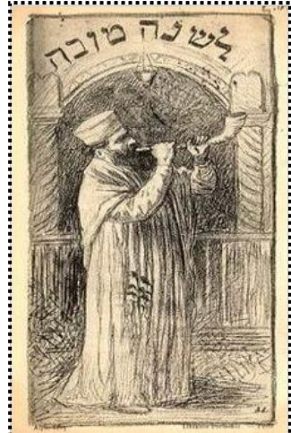
Shofar (by Alphonse Lévy [1]) Caption says: "To a good year"