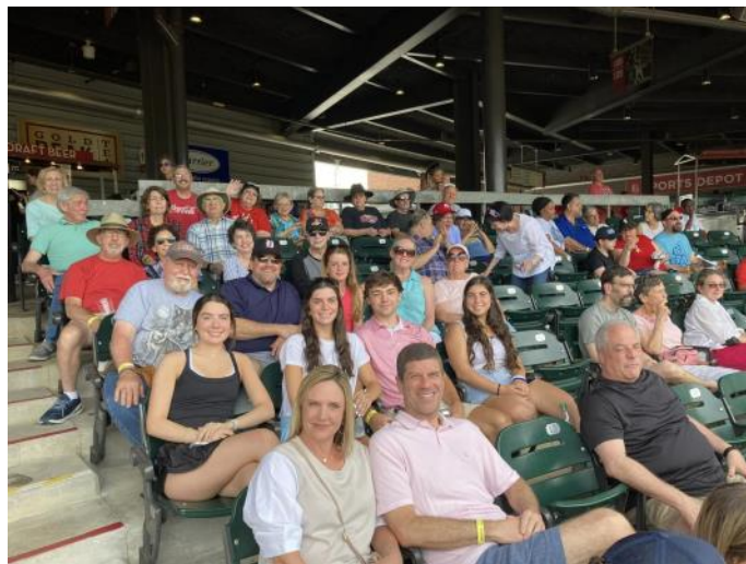
Birmingham Barons baseball with Men's Club