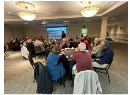
Movie Talk Village