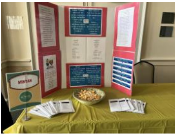
First annual volunteer fair