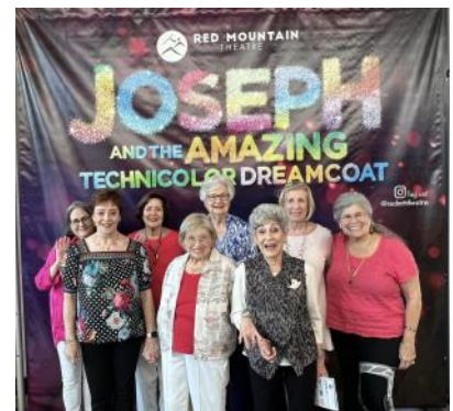
GenXYZ theater visit