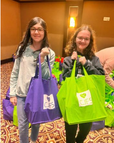
Young Jewish Philanthropy

The photos shown on these pages represent a selection of TBE highlights over the past few months.