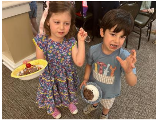
Shavuot ice cream sundaes