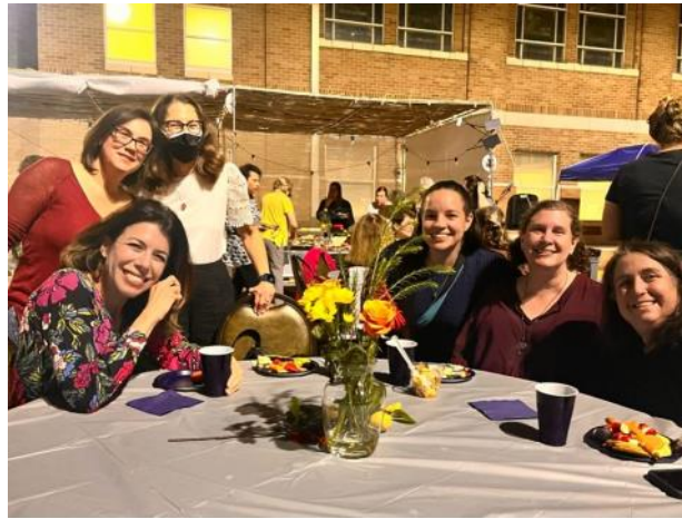
Sisterhood's Sangria in the Sukkah