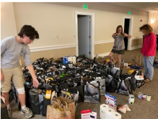
Social Action in action — food drive