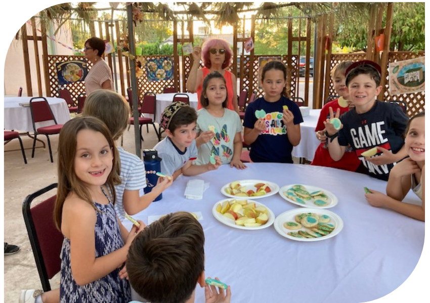
Talmud Torah students enjoying a snack in the Sukkah!