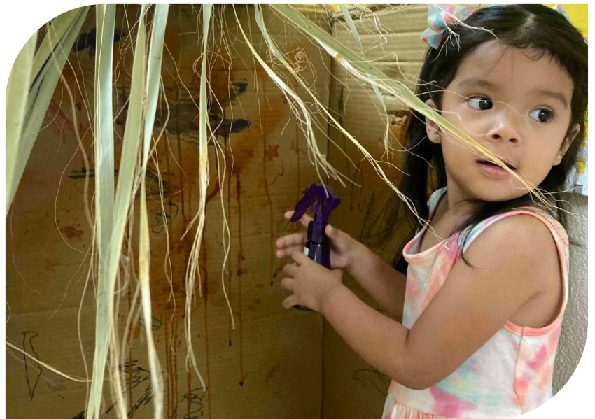
Preschool student decorating the classroom Sukkah!