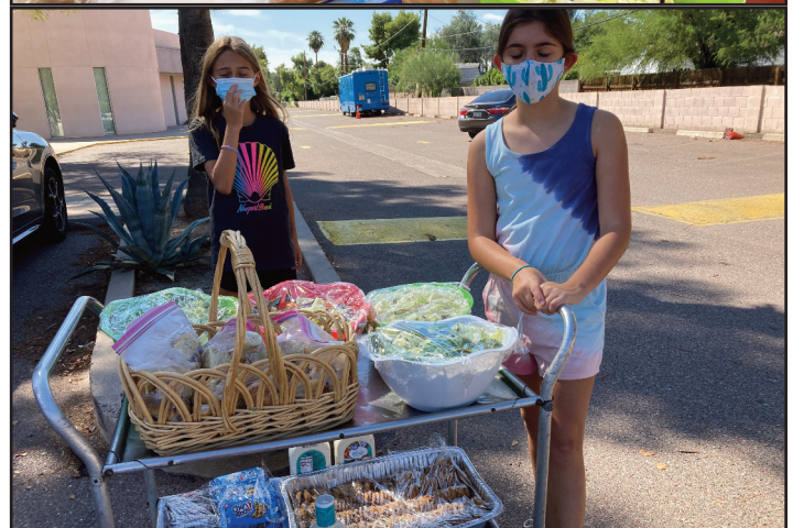
Pictured above: Talmud Torah prepares meals for asylum seekers.