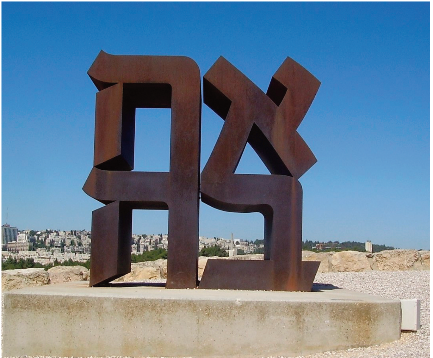
Jerusalem sculpture spelling out “ahava,” Hebrew for “love.”