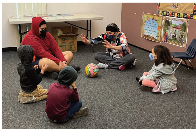
Pictured above: Rabbi enjoys time with the Pre-K class.