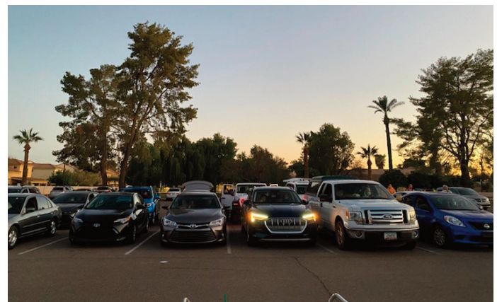
Purim 2021 - Parking Lot Service