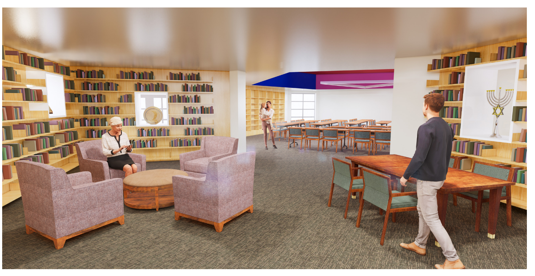
Perspective into new Beit Midrash library.