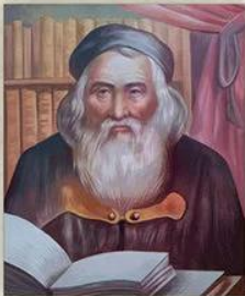
רבי אשר בן יחיאל - רא"ש