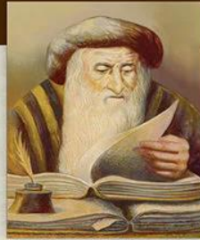
רבי שלמה יצחקי - רש"י