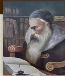
רבי משה בן נחמן - רמב"ן