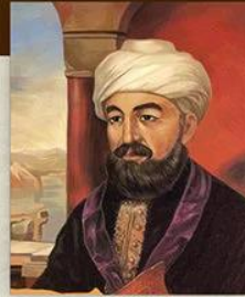
רבי משה בן מיימון - רמב"ם