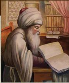
רבי יצחק אלפסי - רי"ף

Banned Polygamy! Departure from the Babylonian academies Europeanized Judaism!