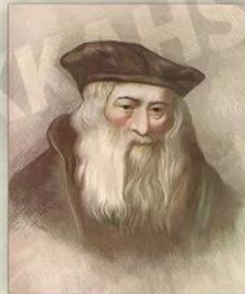
רבי יעקב בן אשר - טור