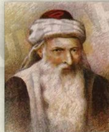
רבי יוסף קארו - בית יוסף