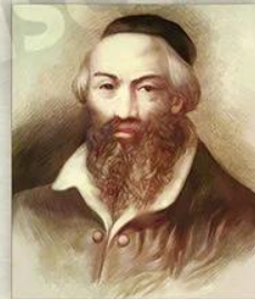
רבי משה איסרלש - רמ"א