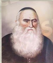
רבי יצחק אברמנאל