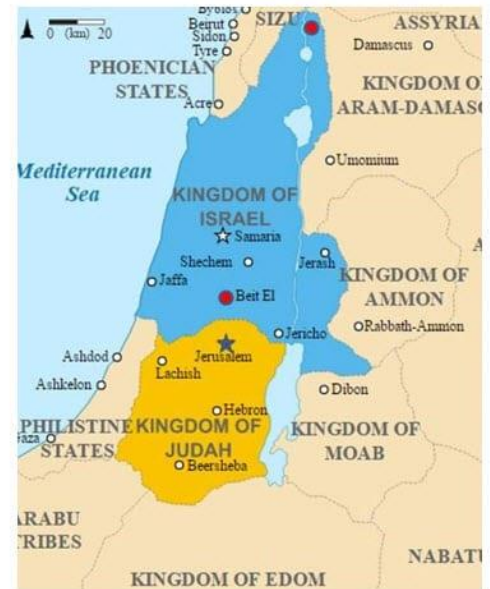
Northern and Southern Kingdoms (Adapted from Wikicommons )

7 All this took place because the Israelites had sinned against the Lord their God, who had brought them up out of Egypt from under the power of Pharaoh king of Egypt. They worshiped other gods 8 and followed the practices of the nations the Lord had driven out before them, as well as the practices that the kings of Israel had introduced. 9 The Israelites secretly did things against the Lord their God that were not right. From watchtower to fortified city they built themselves high places in all their towns. 10 They set up sacred stones and Asherah poles on every high hill and under every spreading tree. 11 At every high place they burned incense, as the nations whom the Lord had driven out before them had done. They did wicked things that aroused the Lord's anger. 12 They worshiped idols, though the Lord had said, "You shall not do this. 13 The Lord warned Israel and Judah through all his prophets and seers: "Turn from your evil ways. Observe my commands and decrees, in accordance with the entire Law that I