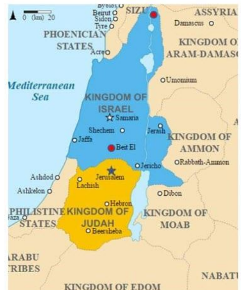
Northern and Southern Kingdoms (Adapted from Wikicommons )