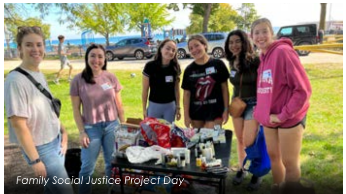
Family Social Justice Project Day