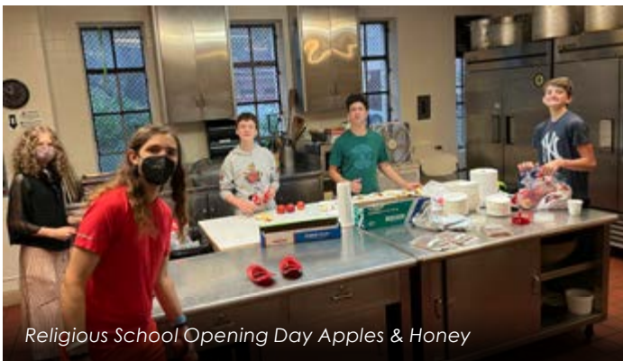
Religious School Opening Day Apples & Honey