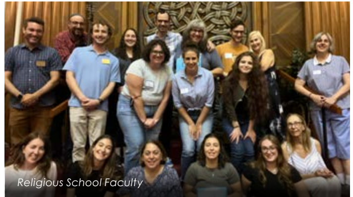
Religious School Faculty