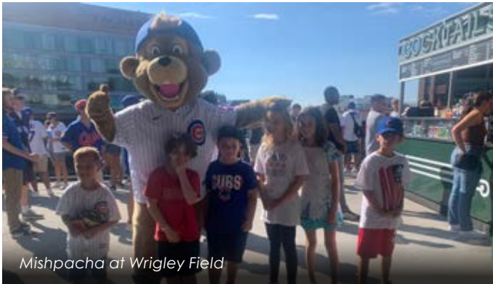
Mishpacha at Wrigley Field