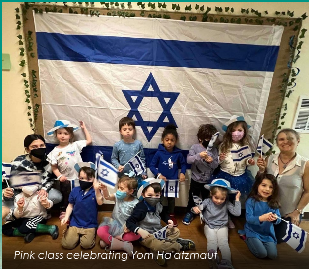
Pink class celebrating Yom Ha'atzmaut