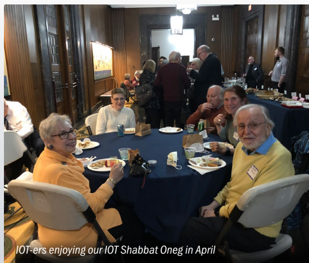
IOT-ers enjoying our IOT Shabbat Oneg in April

While we continue to navigate what our new normal looks like, IOT had another successful year of events! We started last fall with two "Picnic in the Park" events to hang out and nosh around. Our Annual Chanukah Party was once again a favorite amongst the attendees, and of course everyone's dreidel skills were put to the test. For the first time, IOT had a joint book & movie discussion featuring Agatha Christie's Murder on the Orient Express & the 1972 movie version. This past April, we were able to have our annual IOT Shabbat in-person and we gathered after the service for a private, Mexican-themed oneg. It was great to finally be together in person after a long winter and enjoy good company and tasty food. We rounded out the year with our last film discussion of More Than I Deserve , a film which was featured at the Chicago Festival of Israeli Cinema.