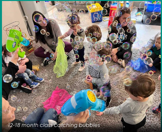
12-18 month class catching bubbles