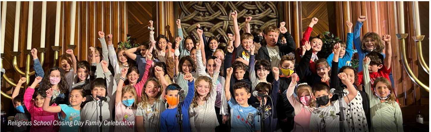
Religious School Closing Day Family Celebration