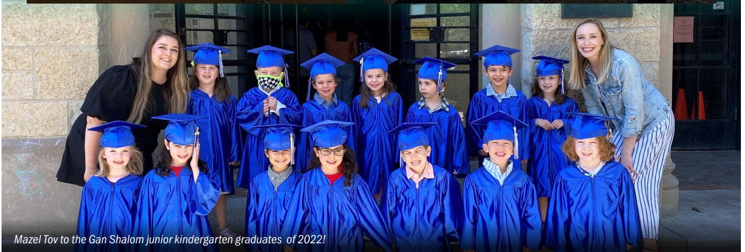
Mazel Tov to the Gan Shalom junior kindergarten graduates of 2022!