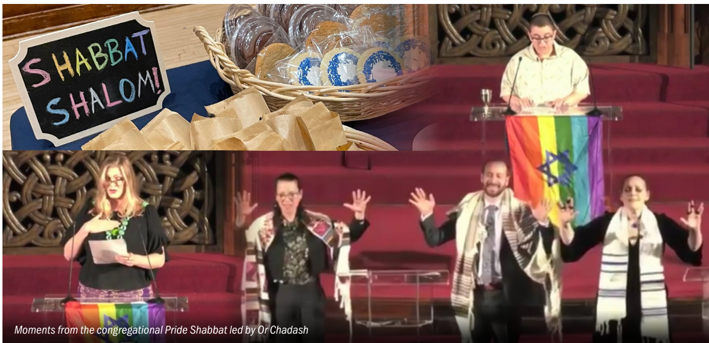
Moments from the congregational Pride Shabbat led by Or Chadash