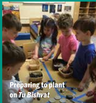
Preparing to plant on Tu B'Shvat