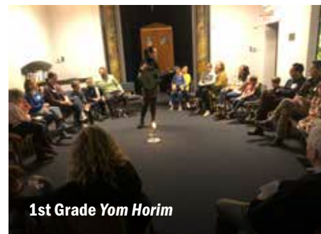
1st Grade Yom Horim

FRIDAY | APR. 24 5:30 PM DINNER | 6:15 PM SERVICE