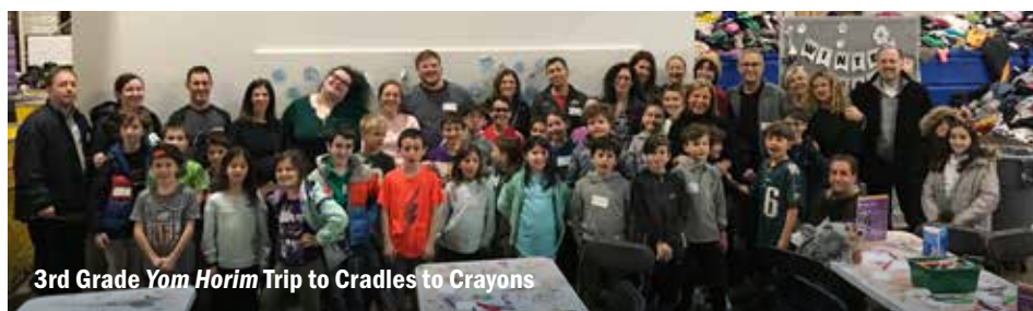
3rd Grade Yom Horim Trip to Cradles to Crayons