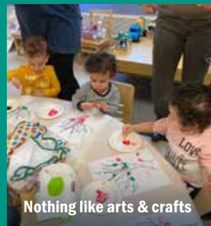
Nothing like arts & crafts