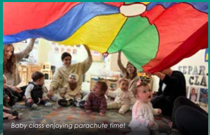
Baby class enjoying parachute time!