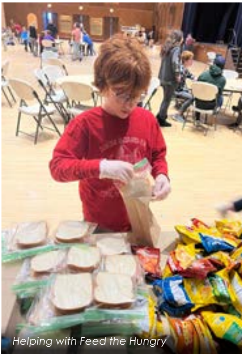
Helping with Feed the Hungry