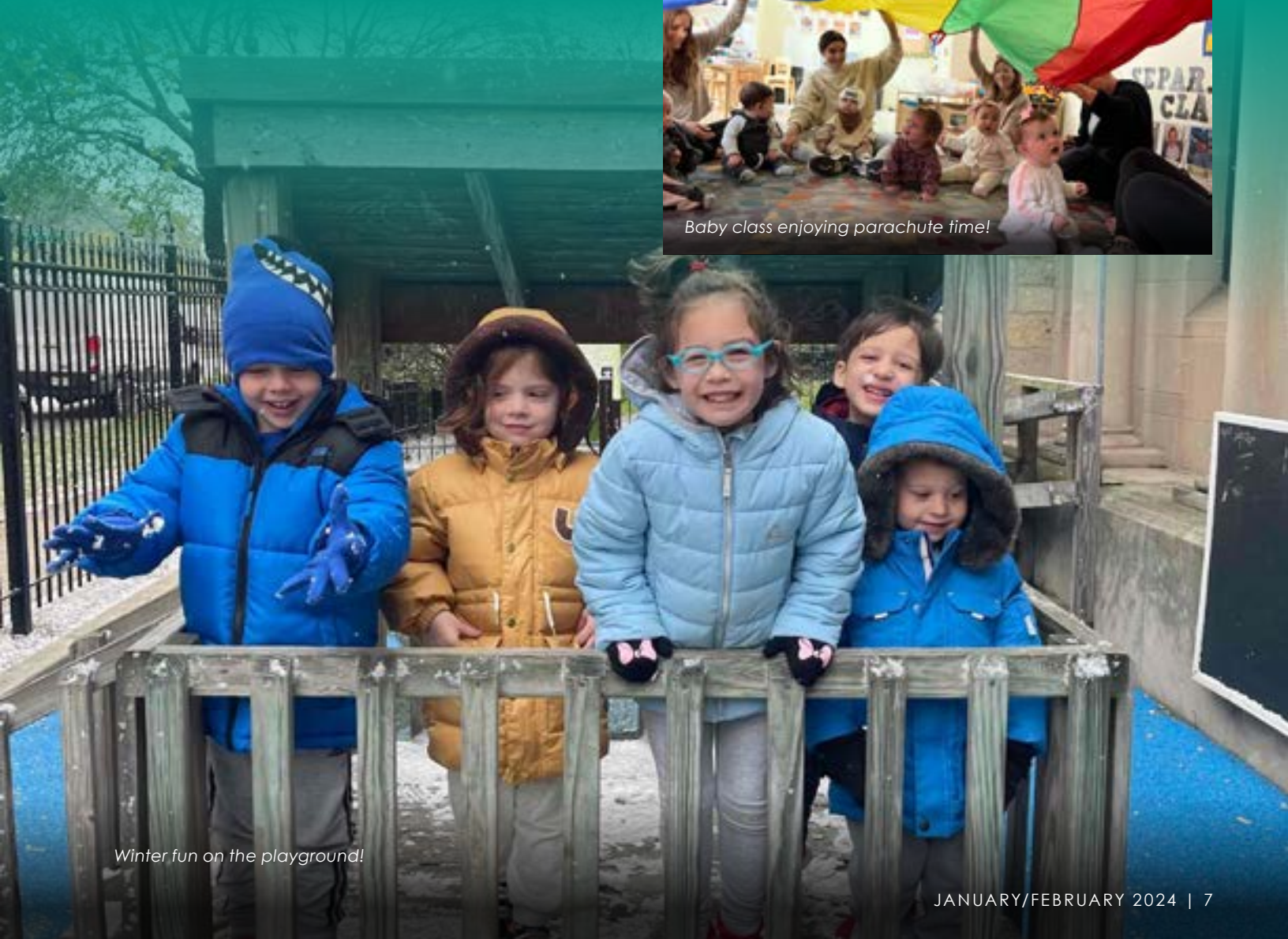
Winter fun on the playground!