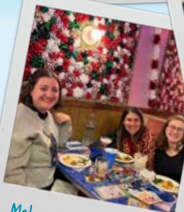
Makom Chanukah Party