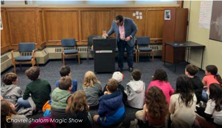
Chavrei Shalom Magic Show

Stay tuned for youth group events in January for both Chavrei Sholom and Noar Sholom!