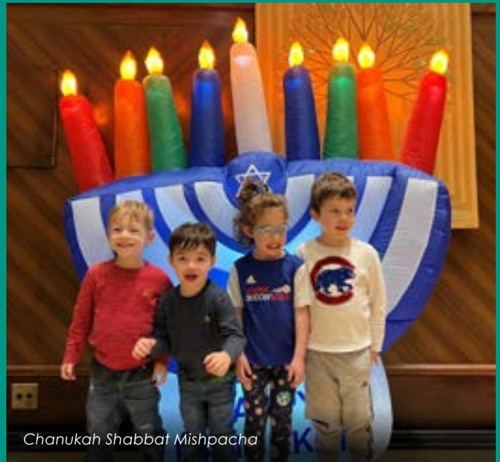
Chanukah Shabbat Mishpacha