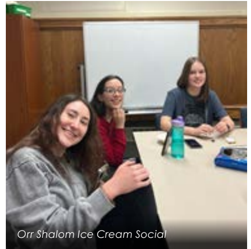
Orr Shalom Ice Cream Social