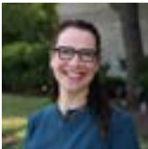
Senior Rabbi Shoshanah Conover

In these darkest of days, I have been holding on to a Chassidic teaching, "A little bit of light dispels a lot of