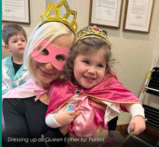
Dressing up as Queen Esther for Purim!