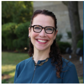
Senior Rabbi Shoshannah Conover

It is strange to write an article six weeks before it will be published... especially about Israel. As I write this on March 20, 2023, 260,000 Israelis have shown up to protest their government's proposed judicial overhaul. For the first time, counter-protestors have shown up in numbers as well. As The Israel Democracy Institute explains, "Supporters of the changes justify them as necessary to rein in an unaccountable judiciary, while opponents of the changes fear that the removal of the only effective check on executive power in Israel will jeopardize civil liberties, economic prosperity, and Israel's international standing." If you are interested in a very thoughtful framing of the situation, listen to The Promised Podcast, "A Conflict That Contains Lifetimes of Conflicts."