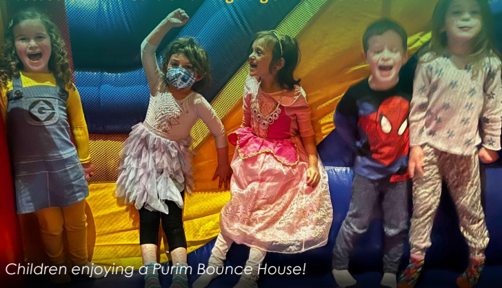
Children enjoying a Purim Bounce House!