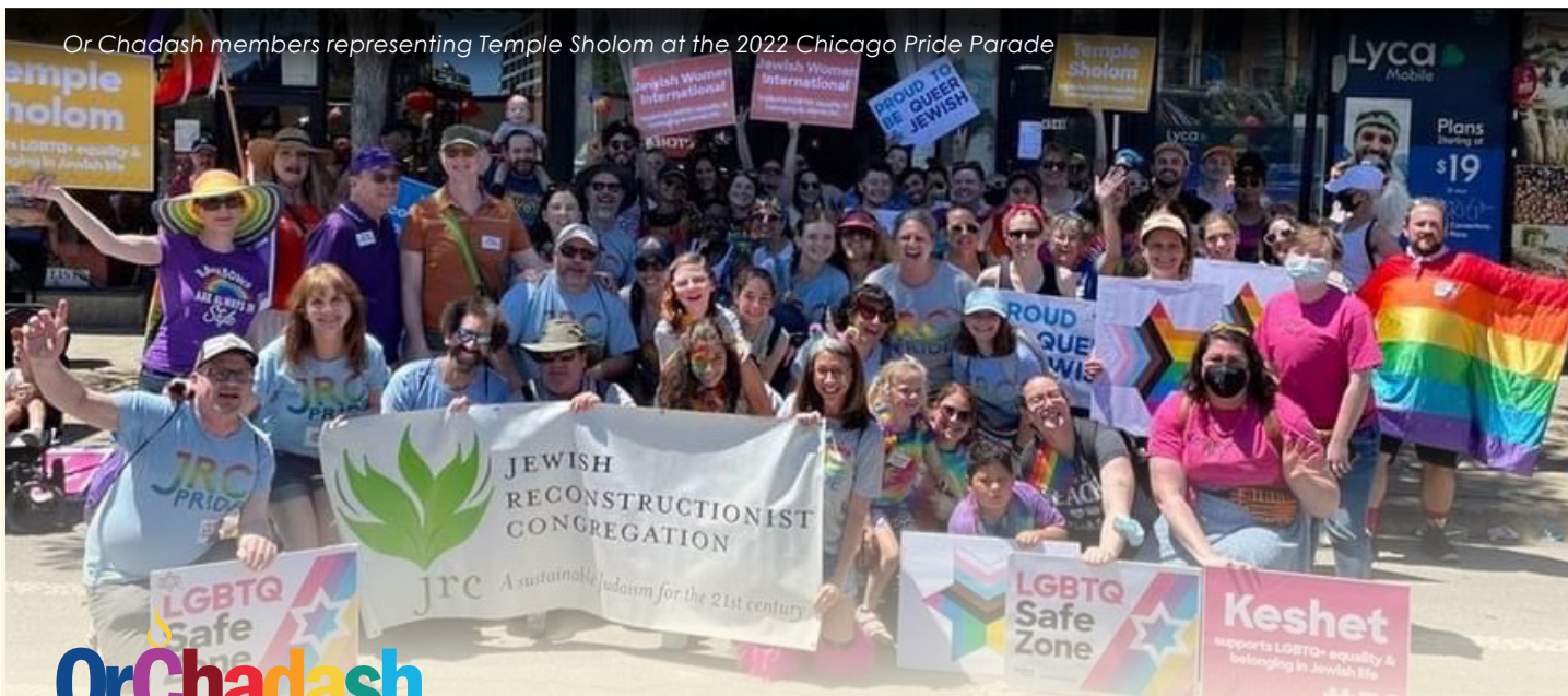
OrChadash members representing Temple Sholom at the 2022 Chicago Pride Parade