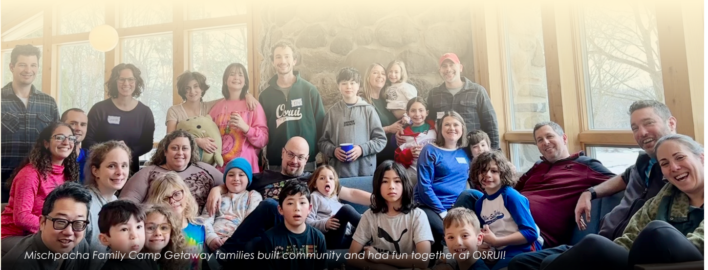
Mishpacha Family Camp Getaway families built community and had fun together at OSRUI!

The theme of the Mishpacha family camp getaway in March was freedom. Where do we experience freedom in our lives? How do we express freedom as children and as adults? What does Judaism say about freedom, from the Mi Chamocha prayer to Passover ? From singing and praying together to playing together, families experienced the fun and community of camp! They sledded, made a Seder plate, talked about their family's symbol of freedom, and deepened friendships during the weekend.