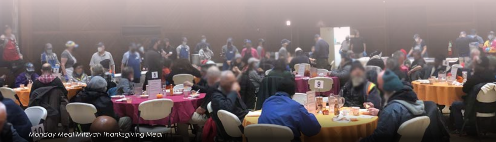
Monday Meal Mitzvah Thanksgiving Meal