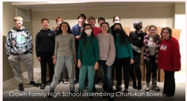
Crown Family High School assembling Chanukah Boxes

Packed, sealed, and delivered! Another year, and another successful Chanukah Box Project completed. Since the pandemic, this was our first Chanukah Box Project that we had our volunteers back in-person. With the help of dedicated packers and drivers, Sholom Justice was able to provide the ingredients to make a warm Chanukah meal for over 70 individuals and families in need in the Chicagoland area. Each year we continue to hear how appreciative the recipients of these boxes are. As always, a special shout-out to the Crown Family High School students who assemble and label the boxes for us!