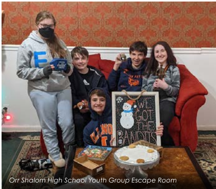
Orr Shalom High School Youth Group Escape Room