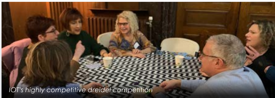
IOT's highly competitive dreidel competition

Temple Sholom's community group that creates adult-only events for those who are 50(ish) and over.