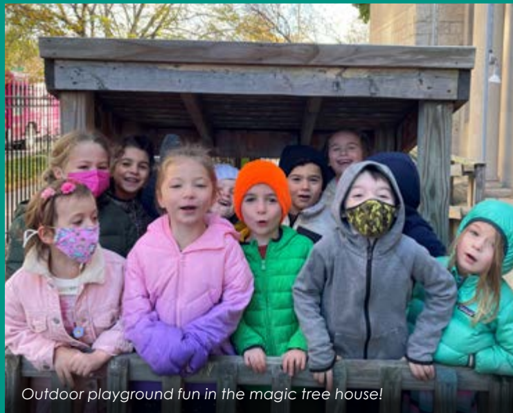
Outdoor playground fun in the magic tree house!