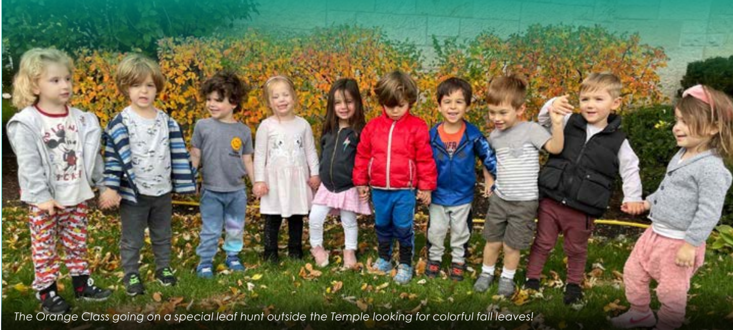
The Orange Class going on a special leaf hunt outside the Temple looking for colorful fall leaves!