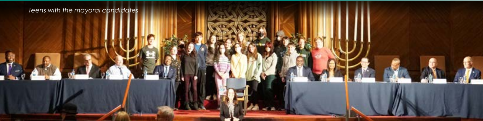
Teens with the mayoral candidates