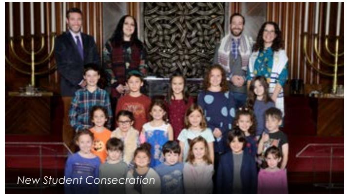
New Student Consecration