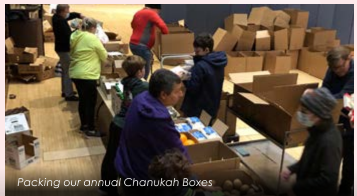
Packing our annual Chanukah Boxes