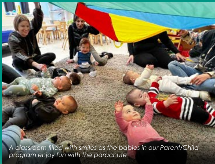
A classroom filled with smiles as the babies in our Parent/Child program enjoy fun with the parachute