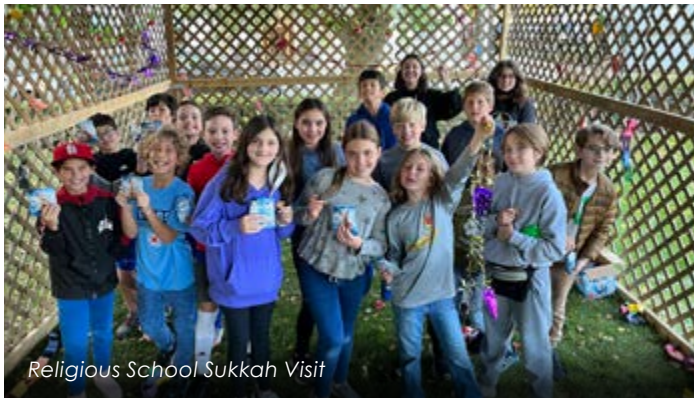
Religious School Sukkah Visit