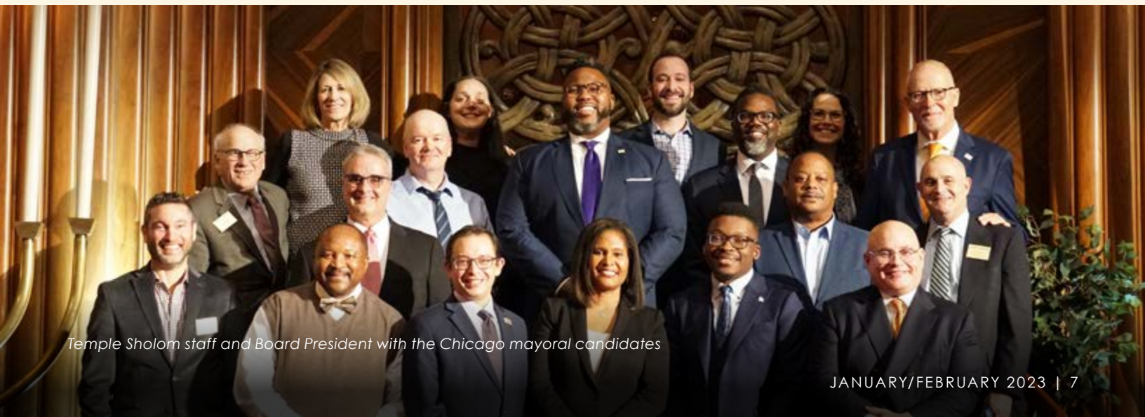
Temple Sholom staff and Board President with the Chicago mayoral candidates