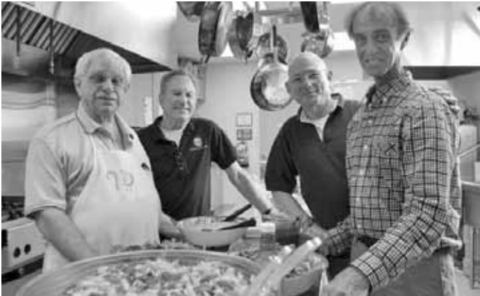
Our beloved bagelmen prepared a delicious feast for the Annual Meeting and Congregational Fair held in May.