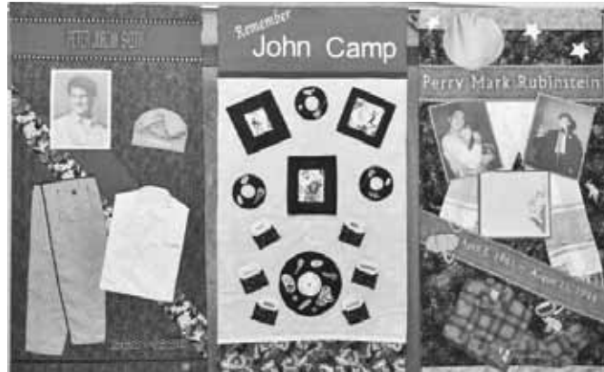
Three new quilts made by CST members and donated to the Names Project.