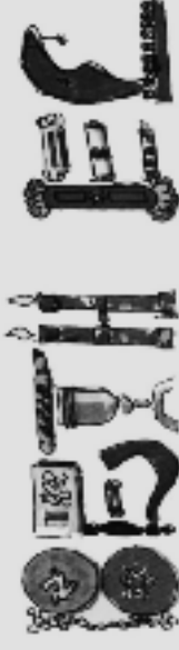
Beth El Sisterhood Judaica Shop

Sponsored by the Beth El Congregation Environmental Committee