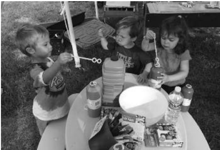
Children enjoyed bubbles, face painting, snowballs and sports at Family Fun Night. We are greatly appreciative of Coppermine for managing our camp and look forward to next summer.