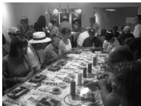
Chocolate Factory at the Golan Heights

Eighteen years ago I marveled at the Israel I saw. On this journey, I was stunned by the continuous progress that goes on in Israel. As a Jew, my trip made me appreciate the Israelis and that I was fortunate enough to experience what their country afforded me.