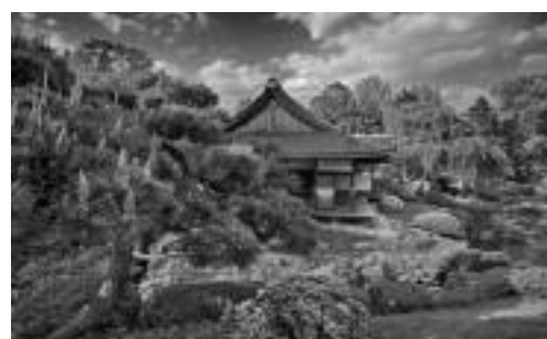
Shofuso, the Japanese House and Garden

We will leave Baltimore at 8:00 a.m. for our morning visit at Shofuso. Shoes are not allowed in the Shofuso house, so please bring socks. A docent will lead us through each room explaining the purpose and significance of all the main features of the house. A viewing garden with a koi pond and island, a tea garden, and a courtyard garden