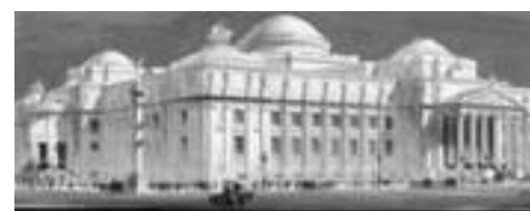
Brooklyn Museum of Art

We will leave Brooklyn at 4:00 p.m. and proceed to the famous Mastore's Diner for dinner on your own. Arrival in Baltimore should be between 8:30 p.m. and 9:00 p.m.