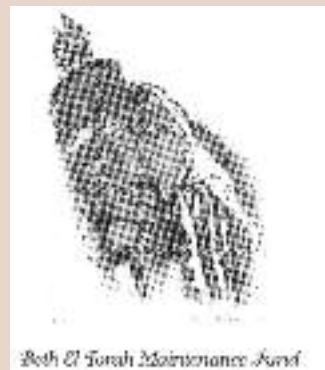
Beth El Torah Maintenance Fund