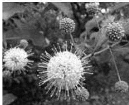
Brooklyn Botanical Gardens

We will leave Baltimore at 6:30 a.m. traveling to the Brooklyn Botanical Gardens where we will have a guided tour to explore the beautiful plants and flowers on display. Following the tour we will take the bus to the Brooklyn Museum of Art where we will have a buffet wrap lunch in the amazing Beaux Arts Court. After lunch, our guides will conduct a tour of the Museum.