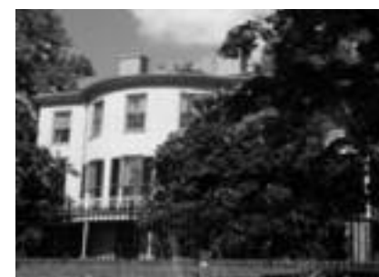
Lemon Hill Mansion

Following lunch we will take the bus to the Lemon Hill Mansion. Through guided tours we will experience the art, architecture, history and horticulture of early 19th century Philadelphia. We will leave Lemon Hill at 4:30 p.m. to return to Baltimore.