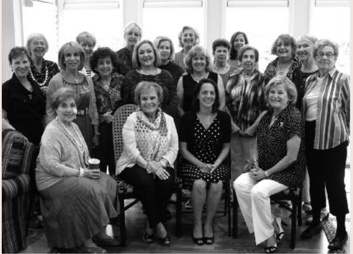
Many of this year's Benefactors.