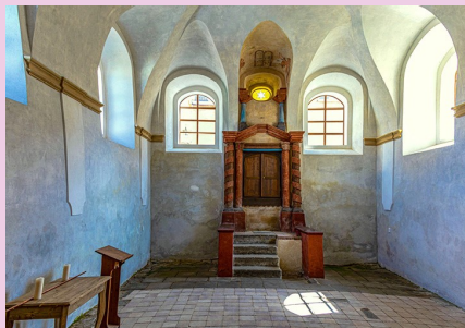
Light Beyond the Shadows The Legacy of the Czech Torah Scrolls and the Renewal of Jewish Life in Czechia