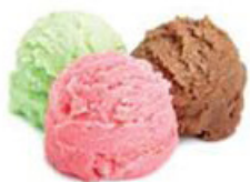
שֶׁהֶפֶל נְהִיָּה בְּדַבְּרוֹ