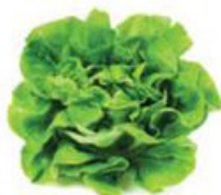
בּוֹרָא פְּרֵי הָאֲדָמָה