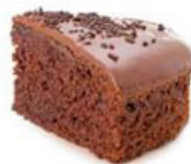
בּוֹרָא מִיַּיִן מִזֹּנוֹת