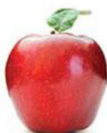
בּוֹרָא פְּרֵי הָעֵץ