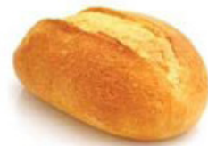
הַמּוֹצֵיא לַחֵם מִן הָאָרֶץ