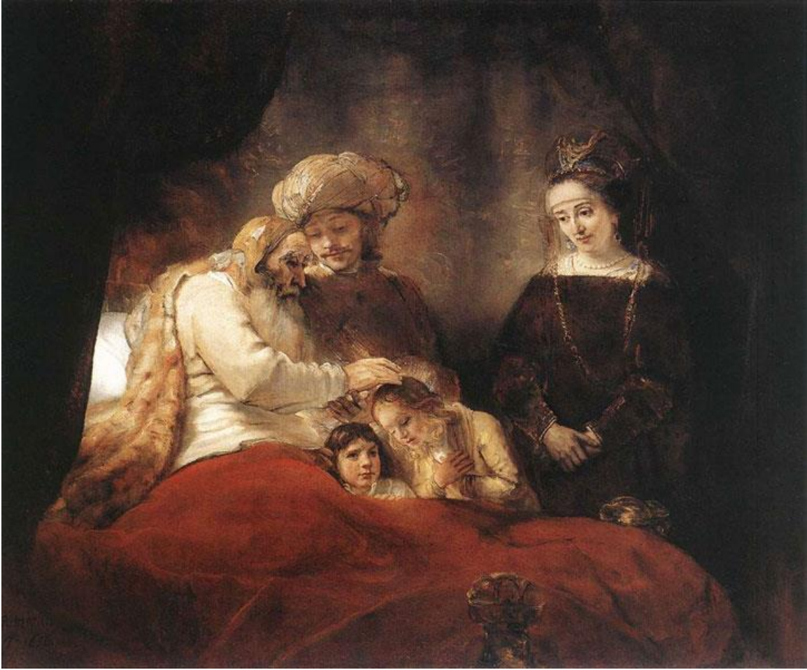
Blessing the Sons of Joseph, Rembrandt van Rijn, 1665 Museumslandschaft Hessen Kassel, Kassel, Germany

“Asenath’s presence at the current scene of benediction is a symbol of, as Simon Schama puts it, ‘the artless innocent mother, in implied contrast to Rebecca, the artful and culpable thief of Esau’s benediction.’ [Rembrandt’s Eyes, p. 607.] Through Asenath, in her role as daughter-in-law to the patriarch, Jacob has the chance to redress his former sins against his father and brother and confer blessing to both of his grandsons, ending the long history of deception and rivalry. Asenath represents not only the caring wife, mother and daughter-in-law, but also the penitent convert to Judaism and the reconciler of generational strife.”