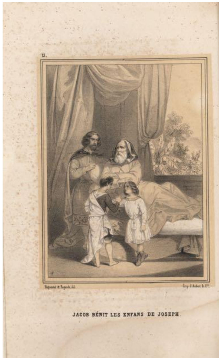
La Semaine Israelite (French version of Tzema Urena), Paris, France, 1846, Gross Family Collection, Tel Aviv