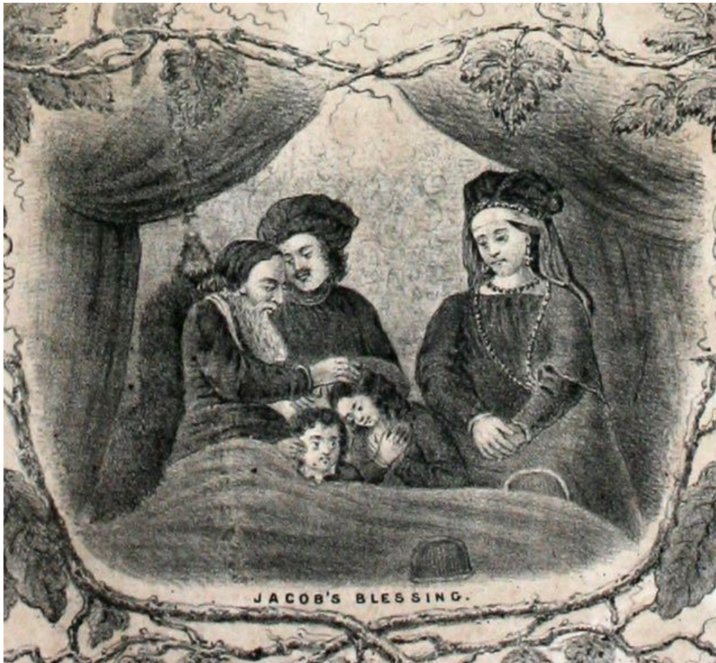
Mizrah, United States, ca1880, Gross Family Collection, Tel Aviv

Another depiction of Jacob blessing Joseph's children: