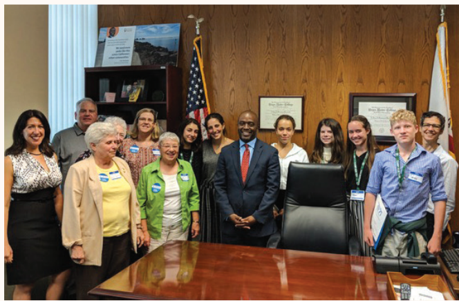
Temple Sinai and Congregation Beth El social action members met with (then) Assemblyman Tony Thurmond on RAC-CA Lobby Day.