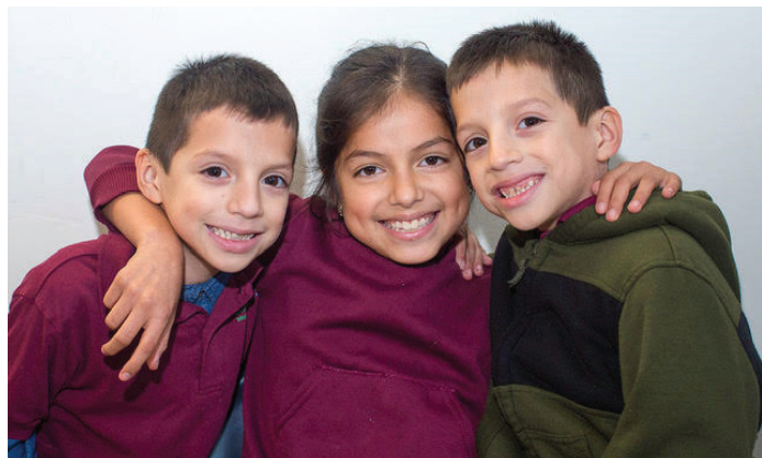
Joyful faces of Greenleaf school students who received gifts from People of the Book's Adopt a Family program!"

The Adopt a Family program (AAF) at Greenleaf Elementary School in Oakland was once again a great success thanks to more than 65 generous donors who brought cheer to over 145 students, nearly a third of the school population.