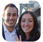
Rapkin & Myers