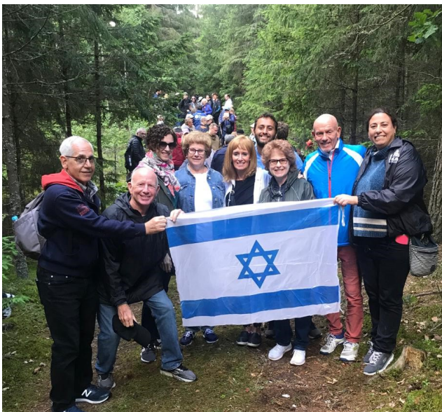
The Zelwin & Freedman Families: Return to Belarus Saturday, August 17 • during morning services