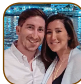
Falk & Baumstein