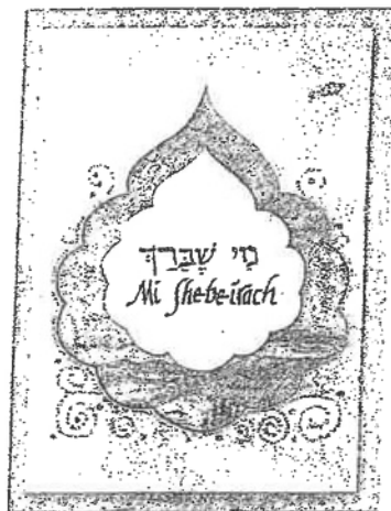
3 Get Well

Send special greetings to your family and friends... and have Torah Fund be an additional beneficiary of your kindness and thoughtfulness.