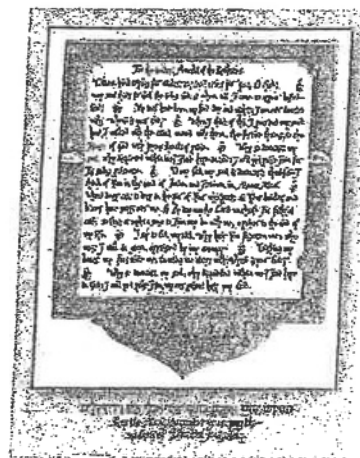
5 Condolence Psalm 42