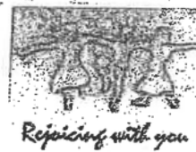
9. Rejoicing with You