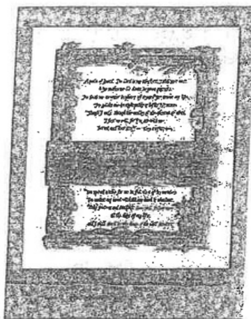
4 Condolence Psalm 23