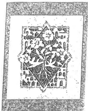
1. All Purpose

Torah Fund Campaign of Women's League for Conservative Judaism Women Ensuring Conservative/Masorti Jewish Education