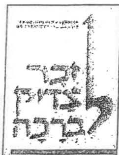
7 Condolence White