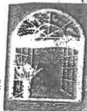
12 Get Well - Blue