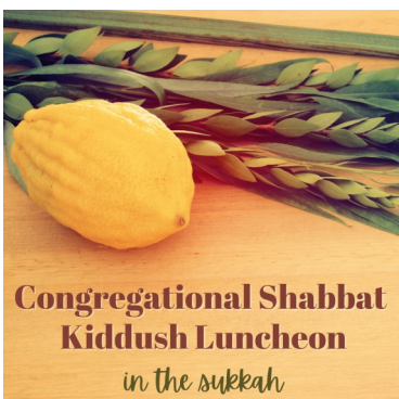
Congregational Shabbat Kiddush Luncheon in the sukkah