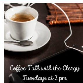
Coffee Talk with the Clergy Tuesdays at 2 pm

All are welcome to join us for a weekly check-in and conversation with the clergy, who will rotate weeks. https://zoom.us/j/94801989217 .