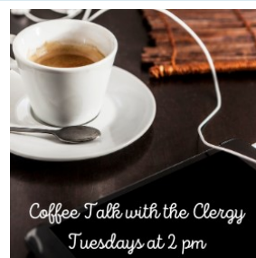
Coffee Talk with the Clergy Tuesdays at 2 pm

All are welcome to join us for a weekly check-in and conversation with the clergy, who will rotate weeks. https://zoom.us/j/94801989217 , Password: clergy.