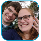
Dehner & Rood