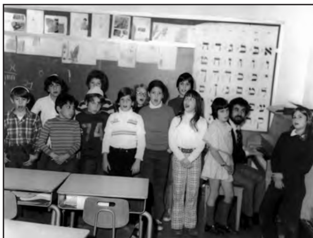
Religious School, circa 1970