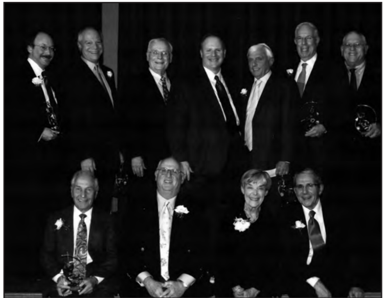
Past Presidents Honored at our 2008 Gala