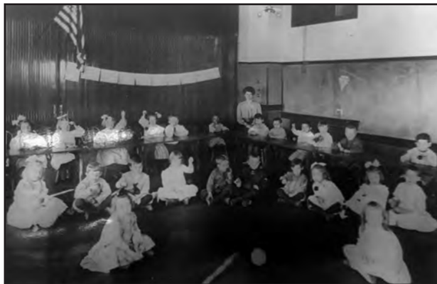
Religious School Kindergarten Class, 1910