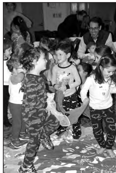
Temple Sholom PJ Shabbat Services

Parents are also highly encouraged to be active participants in their child's early childhood development at school. From participating in the classroom, or overseeing the administration, management and operation of the Nursery School Education Committee, they are a central component to the ongoing success of the Selma Maisel Nursery School.