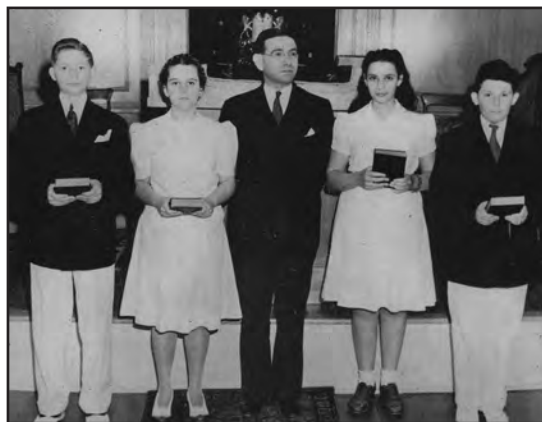
Confirmation Class, 1941