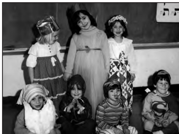
Religious School, 1977