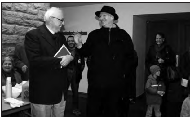
Annual Chanukah Sholom Center Interfaith Lighting, 2015