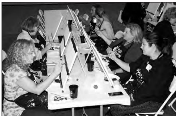
Women's Paint Night