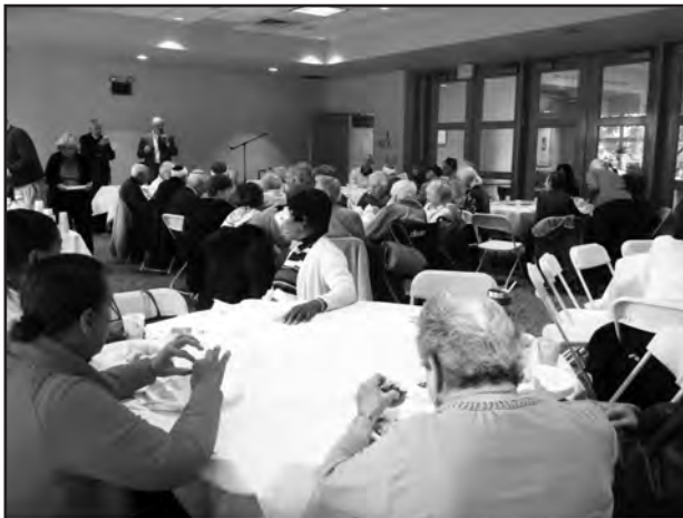
Lunch 'n Learn