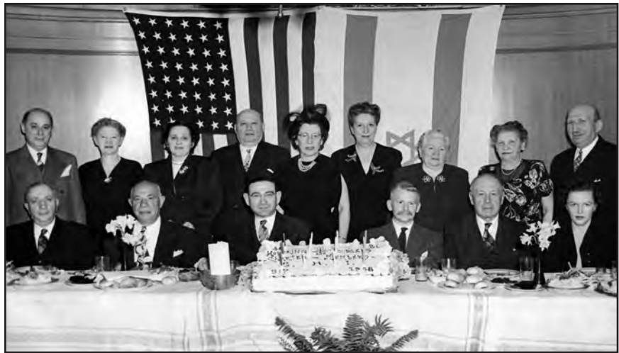
Charter Members, circa 1948

By the post-war era, the Jewish population of Greenwich had grown and the Elm Street home had become too small. Once again, the leading families responded to this growing need, and a building fund was created in 1948.