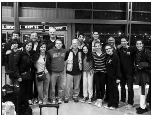
Israel Trip, 2014

We've come a long way in 100 years. Our Temple Sholom community has grown. Today, we have over 650 member families and we celebrate more than 60 b'nai mitzvahs each year. While we are the largest Jewish organization in Greenwich, we draw members from area towns including Stamford, Rye Brook and Armonk, NY. We come together as a community to share in each other's joys and sorrows. From baby namings to weddings and family loss we celebrate, support and comfort each other. Our doors are always open to the community at large.