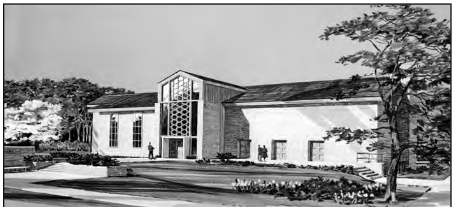
1955 Drawing of the Building