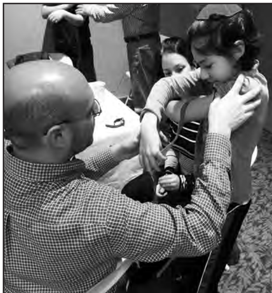
Vav – 6th Grade

Engaging. Interactive. Relevant. Social. These are just a few words to describe the newly reimagined Temple Sholom Learning Center.