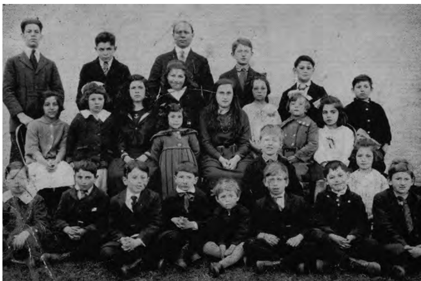
Hebrew and Religious School, 1920

In 1919, the state of Connecticut granted a charter thereby allowing the founders to incorporate the Greenwich Hebrew Institute, the precursor to Temple Sholom, and by 1921, there were sufficient funds to purchase their first building located at 23 East Elm Street.