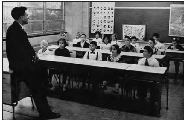
Religious School, 1955