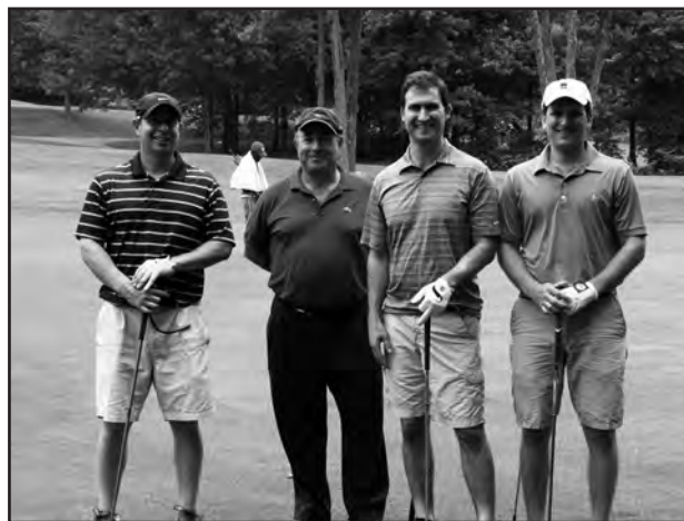
Annual Golf Outing