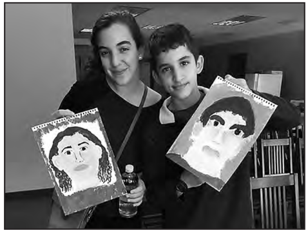
Interactive Youth Programs