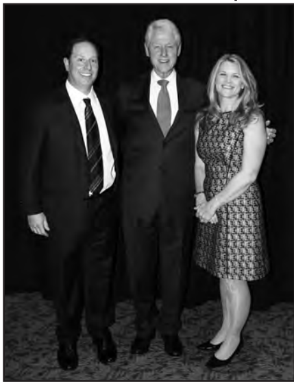
Centennial Speaker Bill Clinton