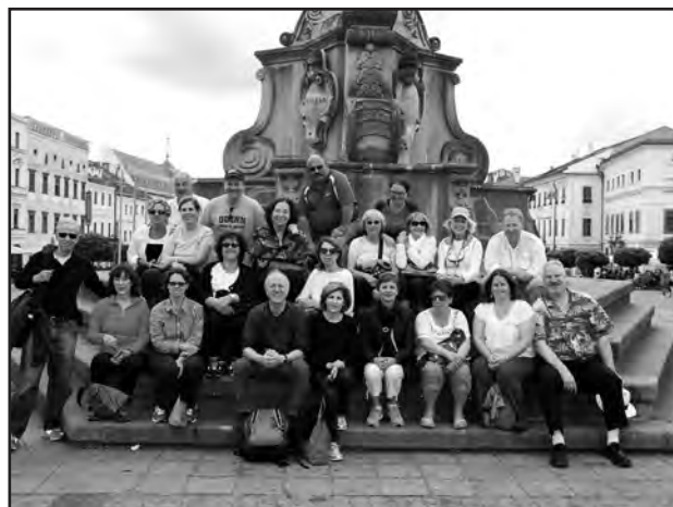
Eastern Europe Trip, 2014