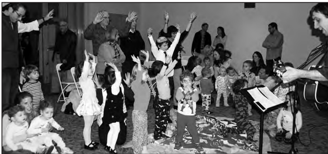
PJ Tot Shabbat