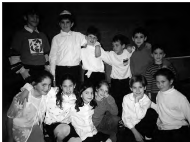
Religious School, 1996