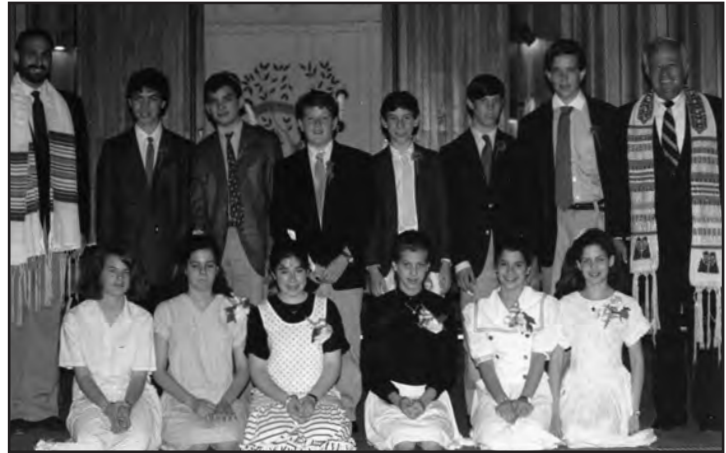
Confirmation Class, 1989

In 1990, to once again accommodate the congregation's growth, the current building was constructed, and the Selma Maisel Nursery School was established.