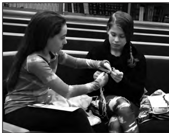
Vav – 6th Grade

it has already garnered lots of support from both students and their parents. Each day, we receive great feedback of how much the students are learning and how pleased everyone is with the program.