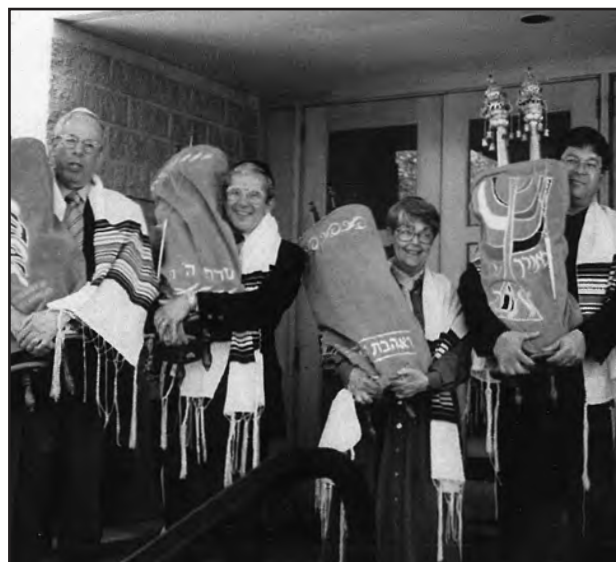
Temple Sholom held a big celebration to dedicate the new Torah.