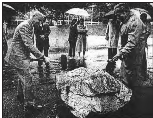
Temple Sholom and Christ Church remove the boulder separating the parking lots, 1985