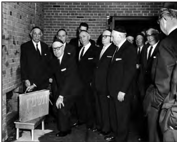
Laying the Corner Stone