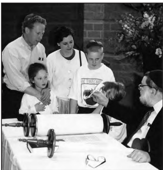
The Hindman Family