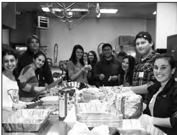
Teen Thanksgiving Cooking