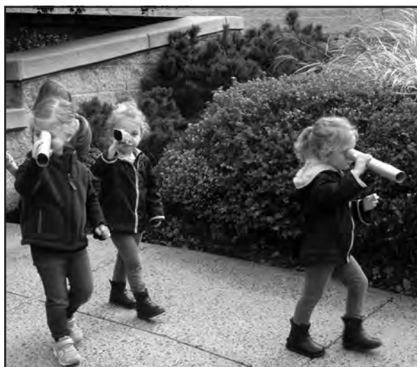
3's Go Exploring