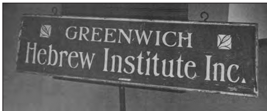
Original Sign from 23 East Elm Street

In 1919, the state of Connecticut granted a charter thereby allowing the founders to incorporate the Greenwich Hebrew Institute, the precursor to Temple Sholom, and by 1921, there were sufficient funds to purchase their first building located at 23 East Elm Street.