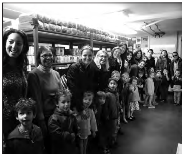
Donating Food to Neighbor to Neighbor