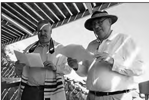
Interfaith Trip to Israel