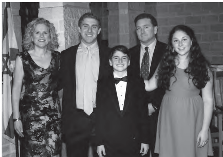
The Latto Family

Congratulations to our Temple on its 100 th Birthday!