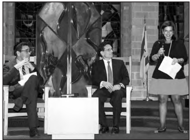
Centennial Speaker Eric Cantor