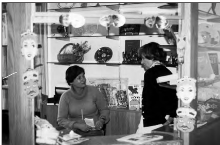
Sisterhood Gift Shop, circa 1970's