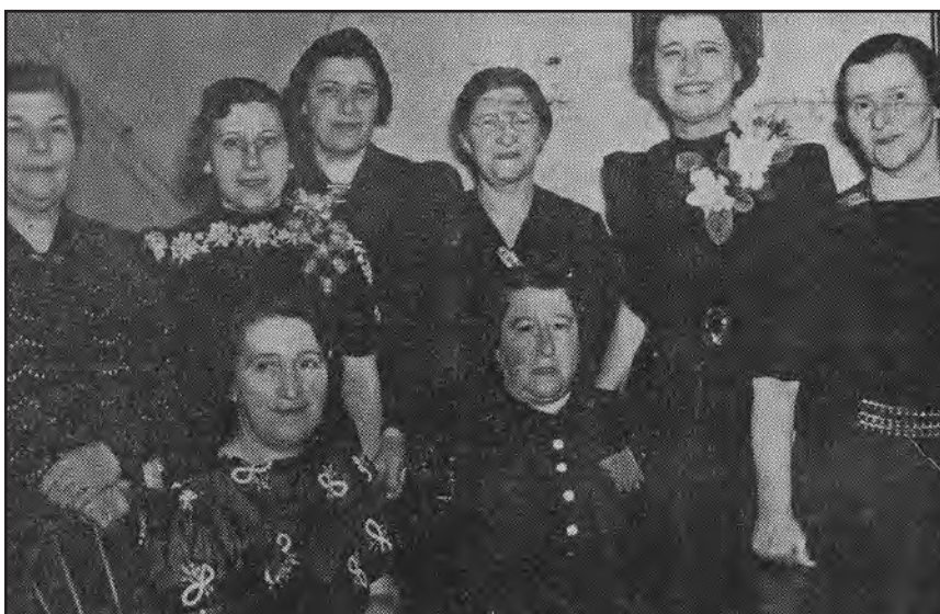
Women's Auxiliary, 1938