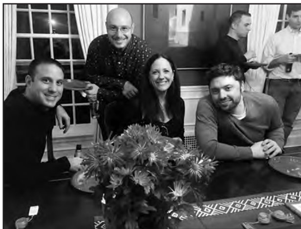
Jewish Network of Young Couples