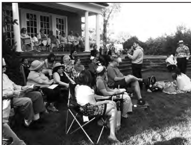
Shabbat on the Sound