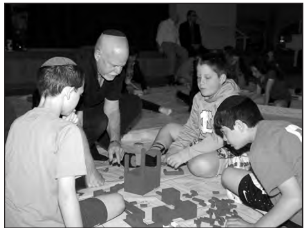
Building Jerusalem with Legos