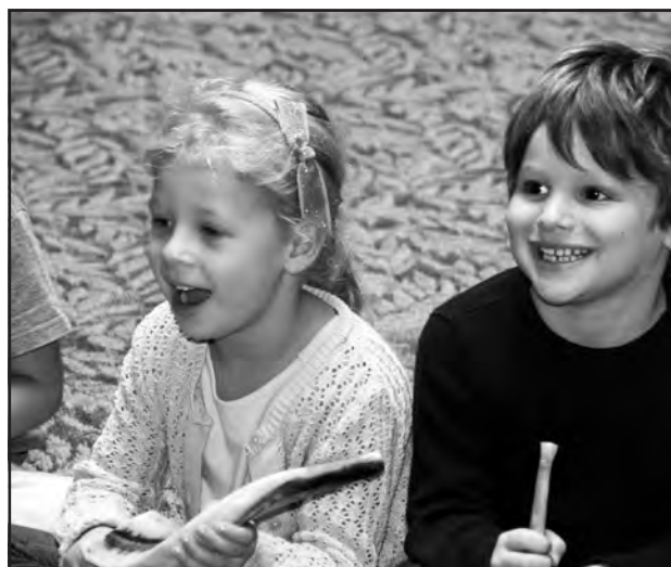
Learning to Blow Shofar