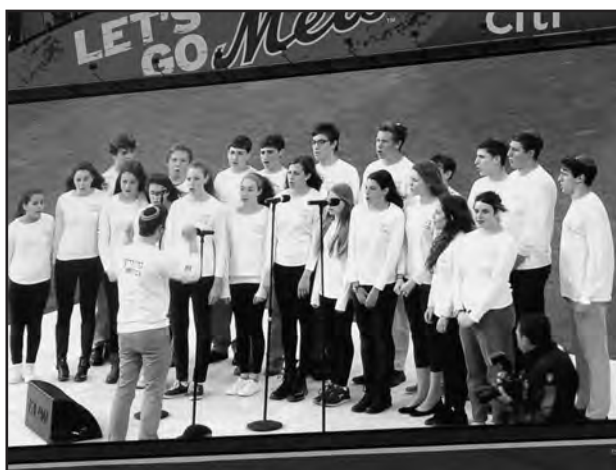
Teen Choir sings the National Anthem at CitiField