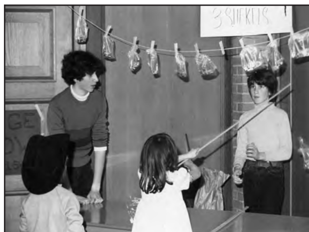
Purim Carnival, 1979