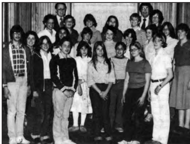
Religious School Hay Class, 1979