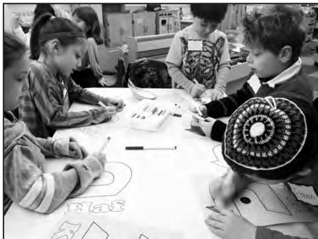
Gan – Kindergarten

Our Kindergarten through second grade students connect primarily through music, activities, play and arts and crafts. They enter third grade with knowledge of Hebrew vowels and consonants, a basic understanding of Jewish holidays and