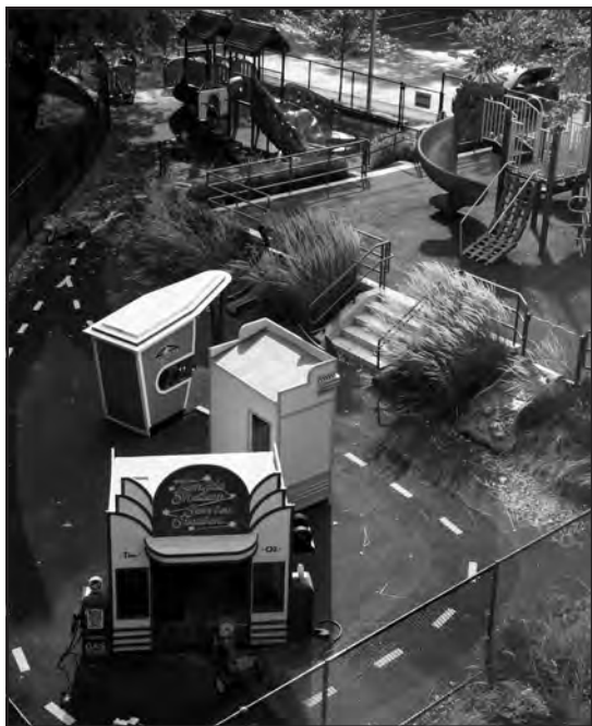
Outdoor Play Area

Our window-filled classrooms are spaces of natural light, bursting with color. Our walls and displays are print-rich, providing exposure to words and labels, songs and poems. Our multi-level outdoor play area stimulates imaginative play in a “child-size” town, while our Discovery Room contains live, semi-exotic animals from the Stamford Museum and Nature Center who the children learn to feed and care for.