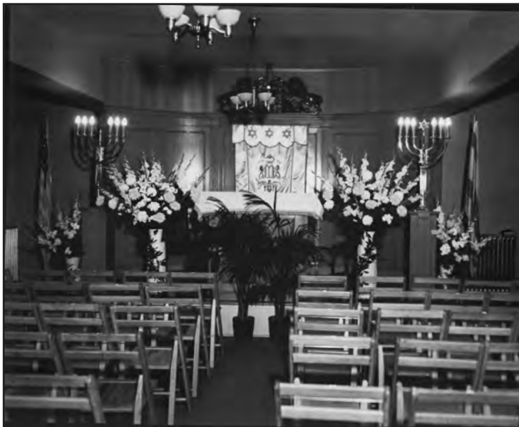
300 East Putnam's First Chapel