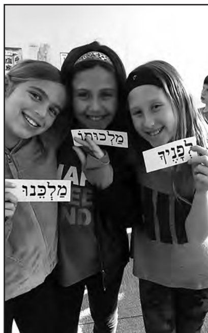
Hey – 5th Grade

Shabbat, a strong sense of ethics through Bible stories, and an introduction to mitzvot.