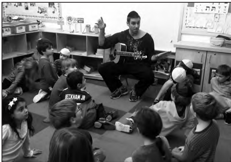
Bet – 2nd Grade