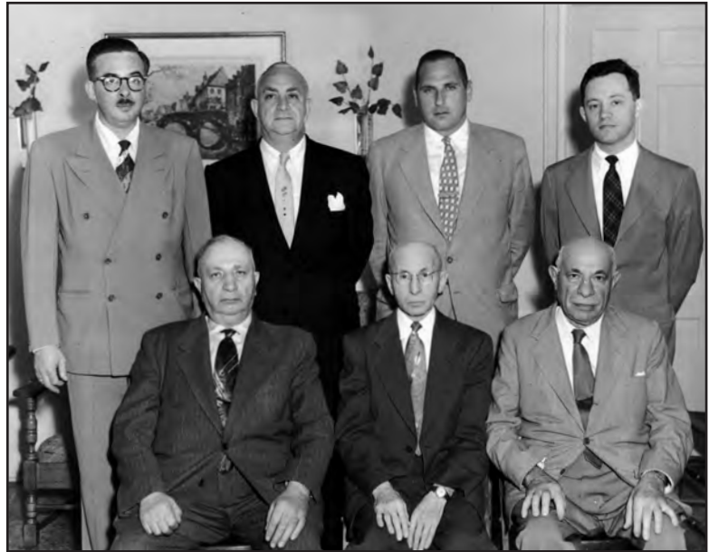
Officers of Temple Sholom, 1953