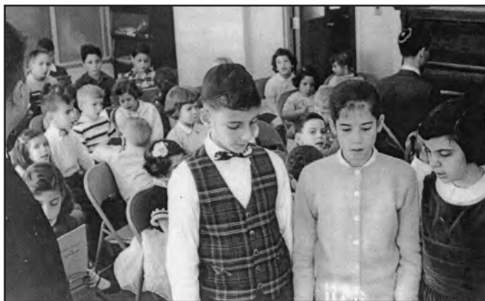
Religious School, 1940