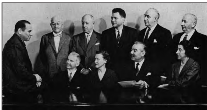
Board of Trustees, 1955